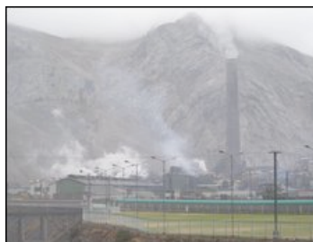
The smelter in La Oroya is one of the 10 most polluted places on earth.