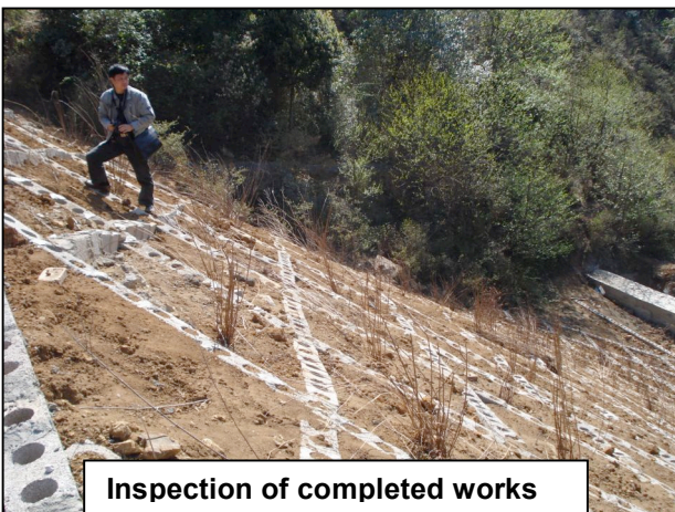
Inspection of completed works

According to the Wenshan County EPB, there are at least five old smelters in the country which need to be addressed and there is an estimated one million tons of polluted materials that needs to be controlled. Ten specific white arsenic residue dumps have been identified by the EPB. Measures are planned to deal with the two worst: Former ErHeGou White Arsenic Factory (which contains 184,000 tons of waste); and Production Area 4 (Big Furnace) of Former Wenshan White Arsenic Factory (assessed by the Blacksmith Technical team as Wenshan Site 1 and identified as a major threat).